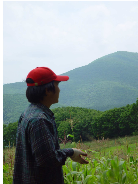
Preparing for the opening of North Korea...